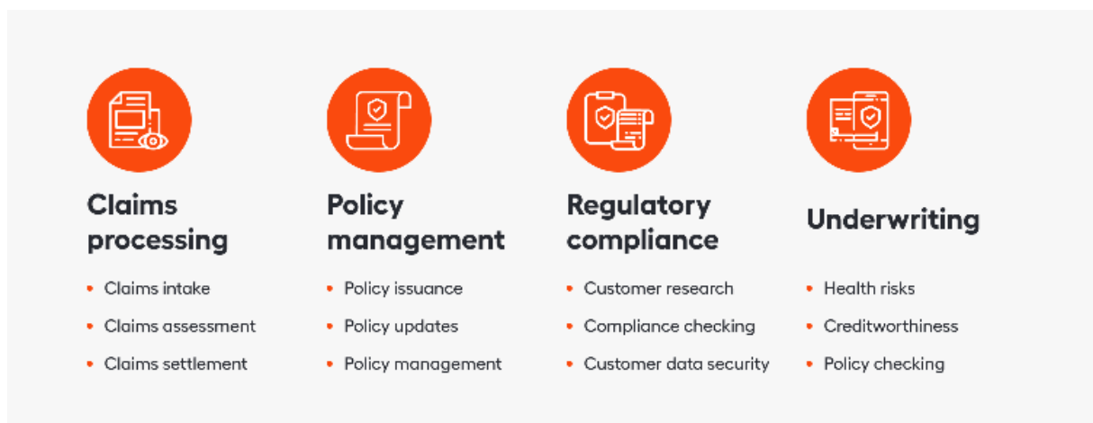
Figure.2: Benefits of Automation in the Insurance Industry. Source

But we will focus on the primary question of how automation will impact the insurance industry? One of the most recent surveys by WorkFusion reveals that automation technologies such as AI have tremendous potential and have several expected outcomes such as creating new jobs, better integration between systems, customer onboarding with the help of chatbots, and allowing personalized services. In addition, WorkFusion suggests that some of the critical areas that will benefit from intelligent systems and automation include claims processing, policy management, regulatory compliance, and underwriting 7 .